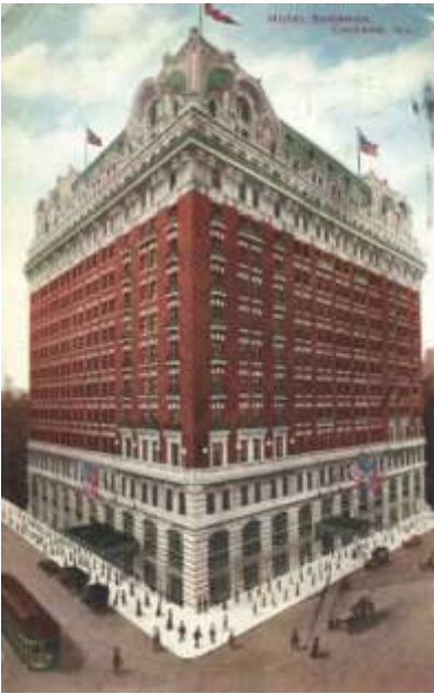
Sherman Hotel 1911

Photos from the slide show as shown at the 100 th Annual Conference in Chicago: