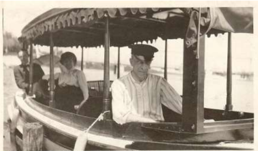
Captain of the Leota July 27, 1917