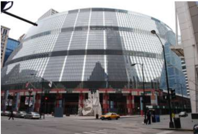
Thompson Center @ Sherman Hotel Site 2010