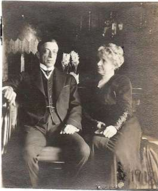
February 10, 1918 28th Anniversary