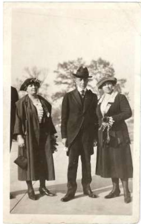
Memphis, TN October 26, 1922 National League of Compulsory Education Conavention