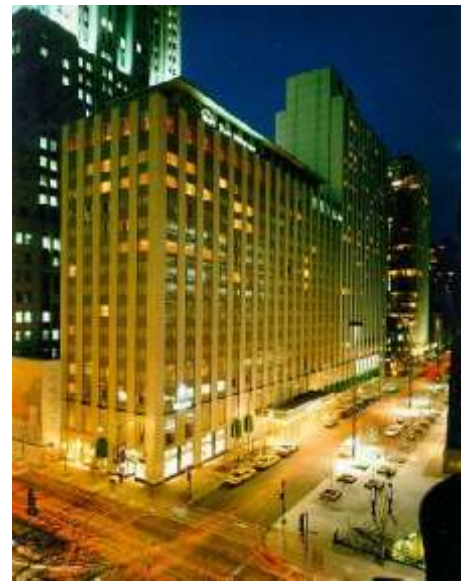
100 th Year Conf. Westin Hotel